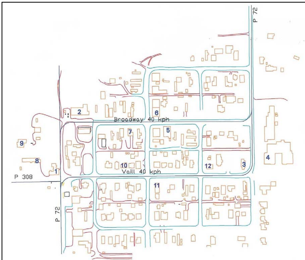
Figure 1. Site map depicting receptors within the town of Belfry, MT 72 Belfry North project area, Carbon County, Montana.