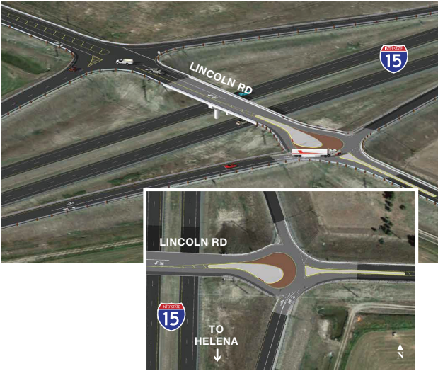
I 15 Northbound Off-ramp

A single-lane roundabout with a northbound right-turn bypass will be constructed. The bypass lane will increase the capacity of the northbound off-ramp.