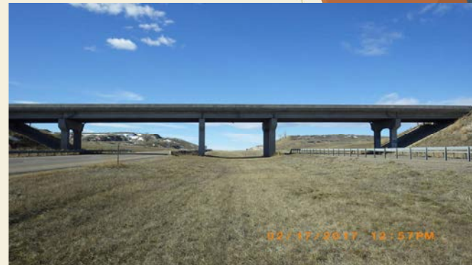
Image of Deck of Colstrip Interchange Bridge