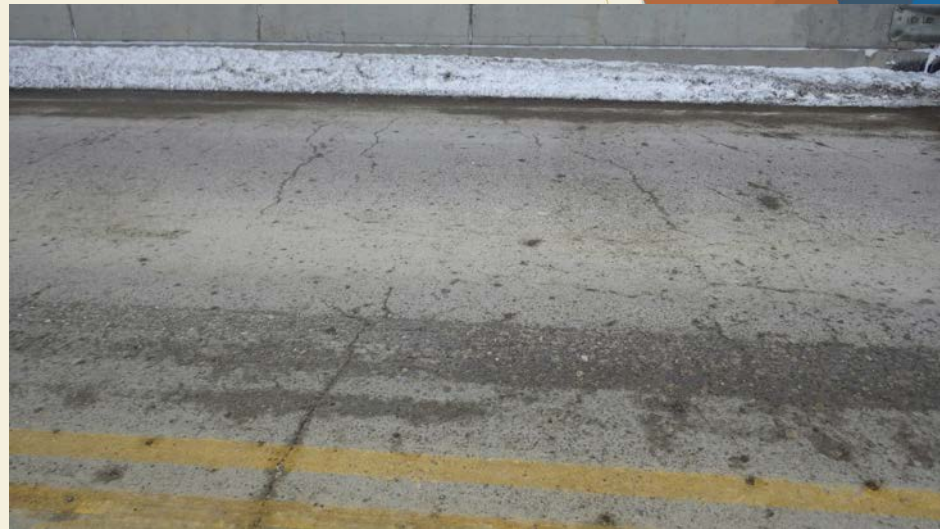
Image of Deterioration to Bridge Deck