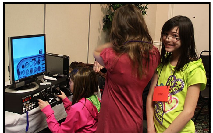
Fifth graders from Margaret Leary School loved the aviation education day especially the flight simulator!