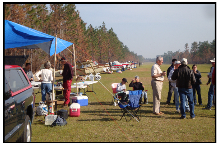
Morning coffee at Blackwater RAF fly-in

The RAF is a non-profit 501(c)3 organization headquartered at 1711 W. College in Bozeman, MT 59715. www.theraf.org .