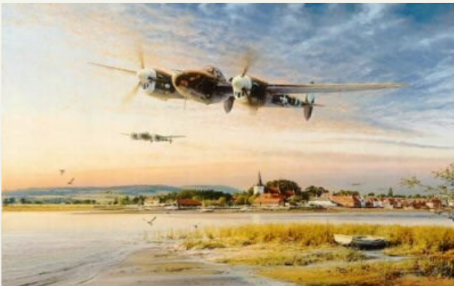
December 8, 2016 10:40 a.m. Original sized to fit document.