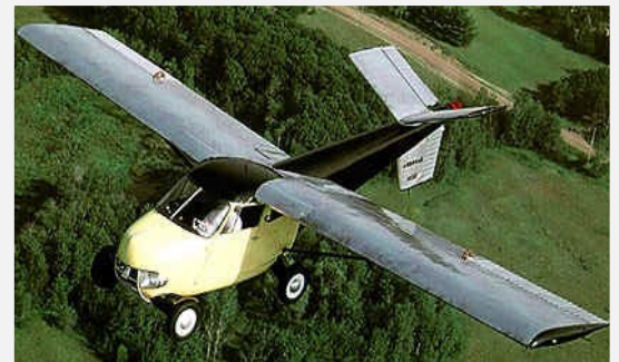
Photo Credit: "Taylor-Aero Car" Golden Wings Flying Museum www.goldenwingsmuseum.com , December 5, 2016 10:08 a.m. *Full permission granted, sized to fit document.