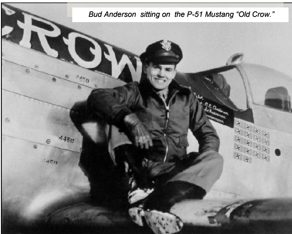
Bud Anderson sitting on the P-51 Mustang "Old Crow."