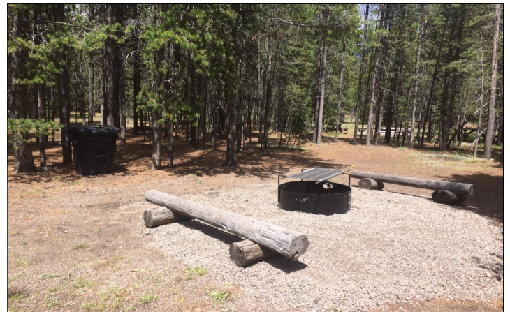
Yellowstone Airport Campground

These improvements will complement the newly improved campsite locations along with the new fire rings we received in 2019 courtesy of the RAF. Come out this summer to WYS and see the campground's makeover!