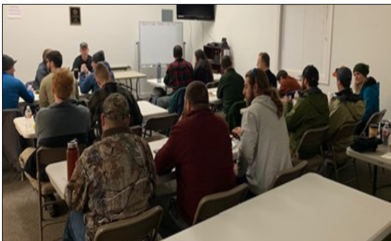
WSC Students in classroom

take to be rescued, but we can prepare and learn how to survive when the odds are against us. Special Forces military experts provided two days of training in shelter construction, signaling, fire starting, hydration and first aid to attendees.