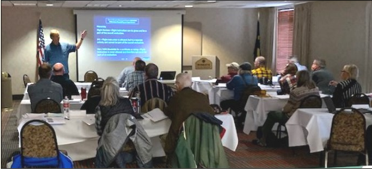
Flight Instructor Refresher Course participants.