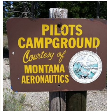
Yellowstone Airport Campground

Yellowstone Airport (WYS) is seeing some improvements at the Pilot Campground. Foremost, the airport is in the process of acquiring a brand new outhouse building. The new building will be made of concrete similar to many of those at United State Forest Service Campgrounds throughout the state.