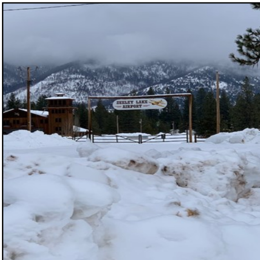
Seeley Lake Airport, Seeley Lake Montana

Twenty-five participants from across Montana and the world, traveled to Seeley Lake Montana in January to participate in the Aeronautics Division's Winter Survival Clinic. One can never predict when an aircraft accident will happen or how long it may