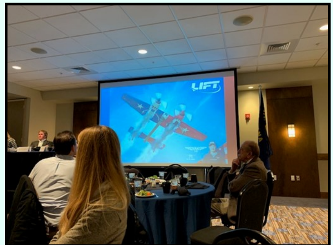
Yak 110 presentation at the Montana Aviation Conference at Fairmont Hot Springs

For your convenience, rooms have been blocked at conference rates at the Holiday Inn Missoula Downtown. Reservations must be made prior to January 31, 2022, to be eligible for the conference rate, and rooms are limited , so make your reservation today! Call the Holiday Inn Missoula Downtown directly at (406) 721-8550 and reference the Montana Aviation Conference to receive the conference rate.