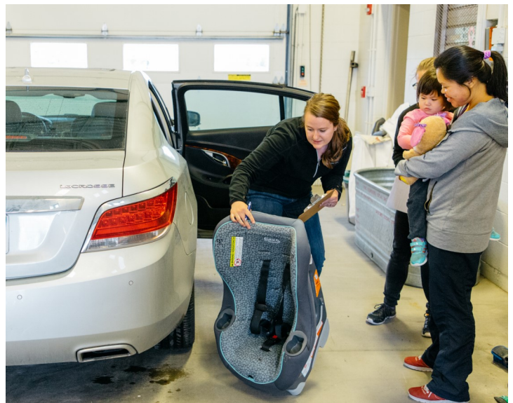
Proper seat installation is demonstrated at a seat check event in Kalispell, Mont.