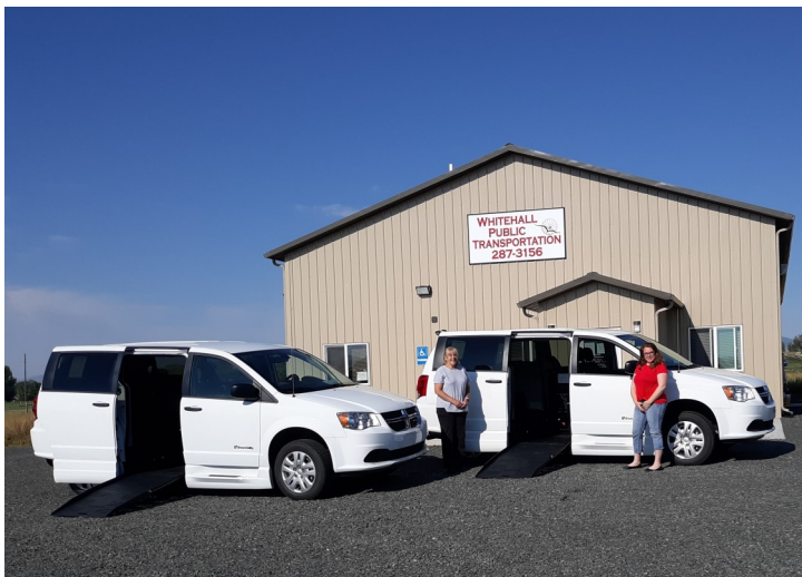
CARES Act funding was put to good use in Montana's rural communities, making additional transportation services available for those who are transit dependent.