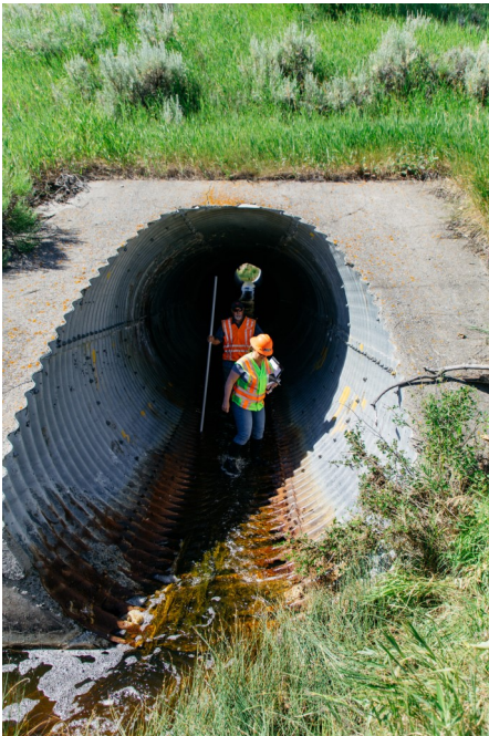
MDT crews inspecting a culvert

Find out more about MDT's MS4 program and how you can get involved in stormwater pollution prevention at mdt.mt.gov/pubinvolve/stormwater/ .