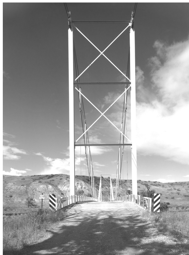
The Pugsley Bridge in Liberty County

The Pugsley Bridge's towers stand in stark contrast to the relative flatness of the northern Great Plains. It is a testimonial to the ingenuity of its designer and of Liberty County for supporting its construction. The bridge continues to serve local ranchers, farmers, and recreationalists. Some may wonder at it now, but at the time of its construction it was hailed as a marvel, a one-of-a-kind structure in the wilds of northern Montana.