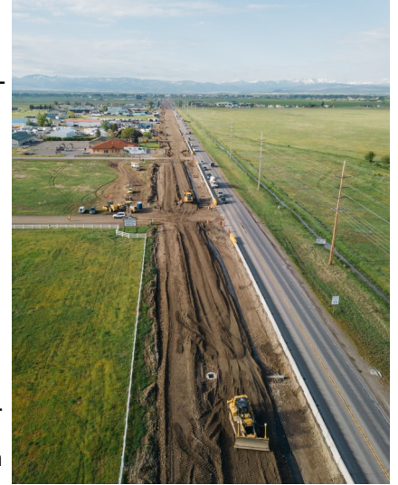
Overhead view of past construction in Belgrade, Mont.

Local officials are encouraged to review MDT's non-metropolitan transportation planning and programming participation process guidelines and submit comments or proposed modifications to the MDT Planning Division. The process for coordinating and cooperating with non-metropolitan local officials on transportation planning and programming issues is not only good business, but also a product of multiple federal and state statutes and intergovernmental agreements. This participation process occurs at both the statewide and small urban area levels and includes: