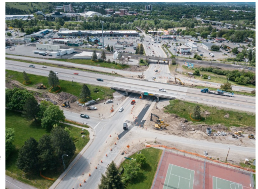
Overhead of Van Buren Interchange project in Missoula, Mont.

Since original construction of the Van Buren Street Interchange in 1966, the city of Missoula has seen tremendous growth – both in residential population and visitation. MDT's improvements to this interchange align with Missoula's long-range transportation plan to decrease traffic congestion, improve air quality, and increase multimodal options. Overall, the project increased traffic flow efficiency and safety for all modes of transportation while enhancing quality of life for residents and quality of experience for Missoula's visitors for years to come. To learn more about the project, visit mdt.mt.gov/pubinvolve/vanburen/ .