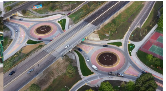
Left: The new Van Buren Interchange in 2019; Center: Finishing touches on the interchange mural; Right: A birds-eye view of the completed roundabouts