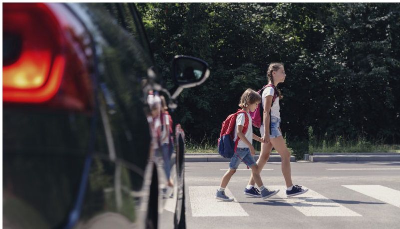
Slow down and watch for increased pedestrian and bike traffic around schools.