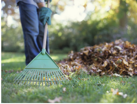
Do your part this fall to help keep pollution out of stormwater runoff, and ultimately, out of Montana's waterways!

For many Montanans, outdoor resources and open spaces are some of our most precious assets. And the fall season is no exception, as we venture out to hike, camp, bike, fish, hunt or float one of the breathtaking waterways our vast state has to offer. There are several things you can do at home or on your adventures this fall to prevent stormwater pollution, keeping Montana's waterways clean for the future.