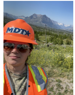
MDT interns enjoy spectacular "office views" when working in the field!

MDT recently celebrated the success of another summer internship program. Interns that participated in 2022 were able to learn firsthand about their chosen career area of the department, ranging from research to engineering. This program starts in May and runs through mid-August, and typically expects a 40-hour work week, Monday-Friday. Internships are paid and available in a number of areas/divisions at MDT. Specific locations and roles vary annually, depending on department needs and upcoming projects. To be eligible to participate, students must: