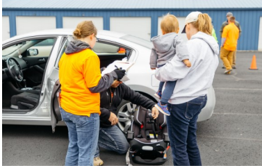
CPS technicians demonstrate safe car seat use and installation to parents and caregivers in Helena, Mont.

Car seats and boosters provide protection for infants and children in a crash, yet car crashes are a leading cause of death for children ages 1 to 13. According to various reports from the National Highway Traffic Safety Administration (NHTSA) and technicians in the field, car seat, booster seat, and seat belt misuse rates vary from 74% to 90%. That's why it is so important to choose and use the right car seat correctly every time your child is in the car.