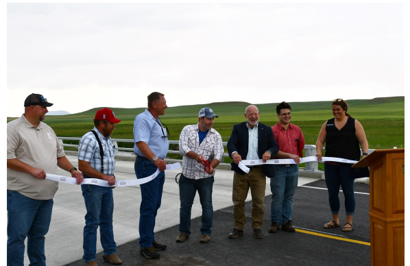
MDT’s Director Long (pictured third from the right) performs the ribbon-cutting honors on July 13th in Denton, Mont.

Did you know? MDT plans and facilitates projects through the Emergency Relief Program (ER). The ER Program allows for repairs to federal-aid highways that have suffered serious damage as a result of (1) natural disasters, or (2) catastrophic failures from an external cause. The Federal Highway Administration (FHWA) will fully reimburse emergency repair costs (such as materials, labor and equipment) at eligible disaster sites. FHWA also allows for permanent restoration work, to be reimbursed at Montana’s standard federal rate (varies by highway system). The state provides matching funds for ER projects, which originate from the state highway special revenue account. Learn more about funding programs and related projects at https://www.mdt.mt.gov/pubinvolve/stip.aspx .