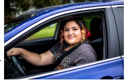
Make sure your teen understands the importance of safety before they hit the road!

According to the Centers for Disease Control and Prevention (CDC), motor vehicle crashes are the second leading cause of death for teens in the United States. In Montana, there have been 127 teen fatalities over the last five years. Of those fatalities, 62% were unrestrained. In addition, teens account for over 4,200 crashes each year on average.