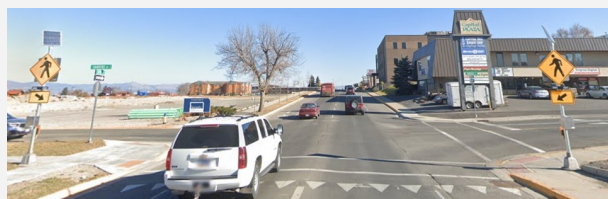
An example of an RRFB installed and in-use in Helena, Mont.

A RRFB is intended to improve visibility at uncontrolled, marked crosswalks. They are placed under the pedestrian crossing sign on both sides of a crosswalk. If a pedestrian wishes to cross, they press a button and the RRFB flashes. As they cross, a motorist can easily see the flashing lights and yield to the pedestrian. RRFBs are being installed more and more around the state – particularly in urban areas. According to the Federal Highway Administration (FHWA)*, RRFBs can reduce crashes up to 47% and increase motorist yield rates up to 98% when installed appropriately and correctly.