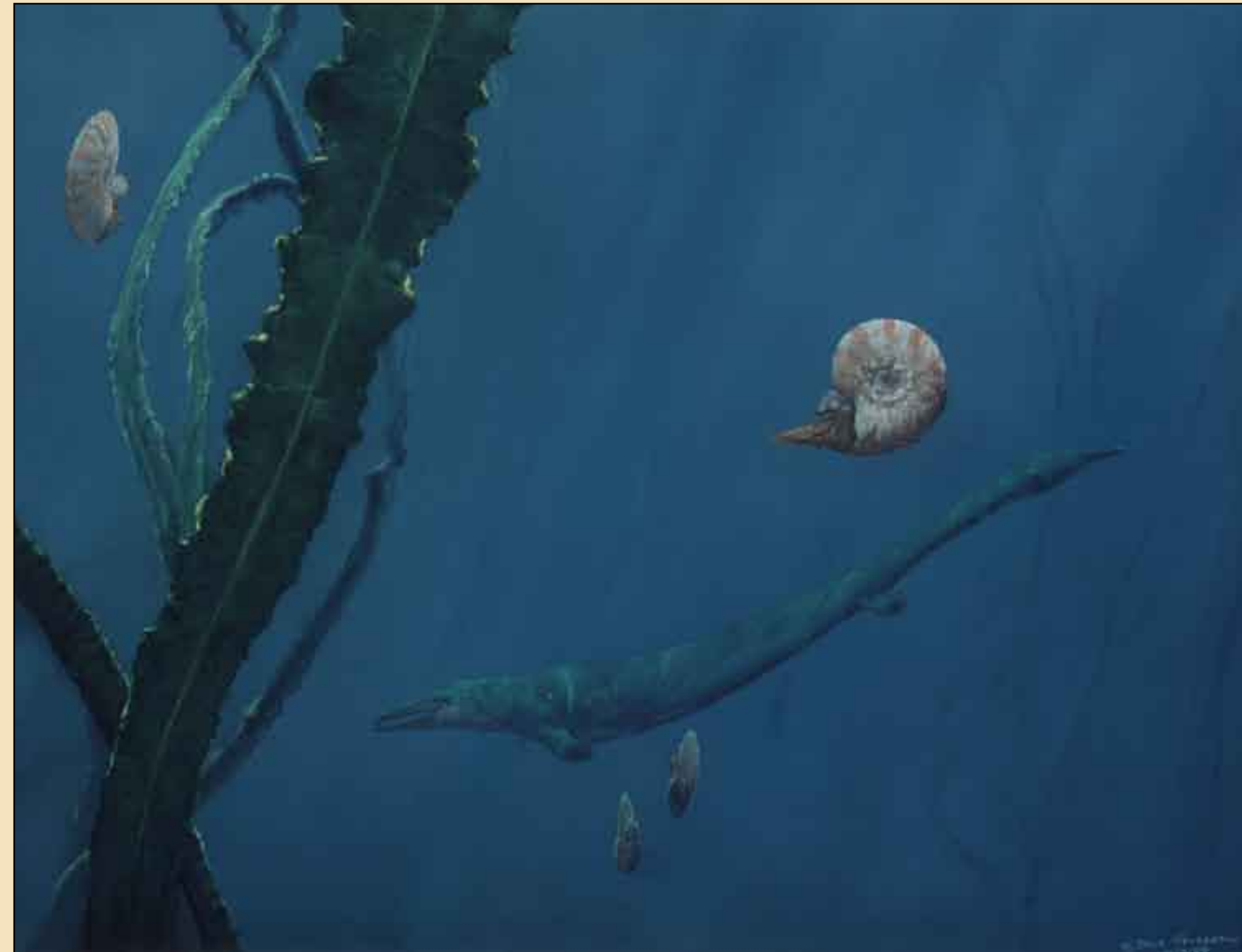
Cretaceous Mosasaur and Ammonites.