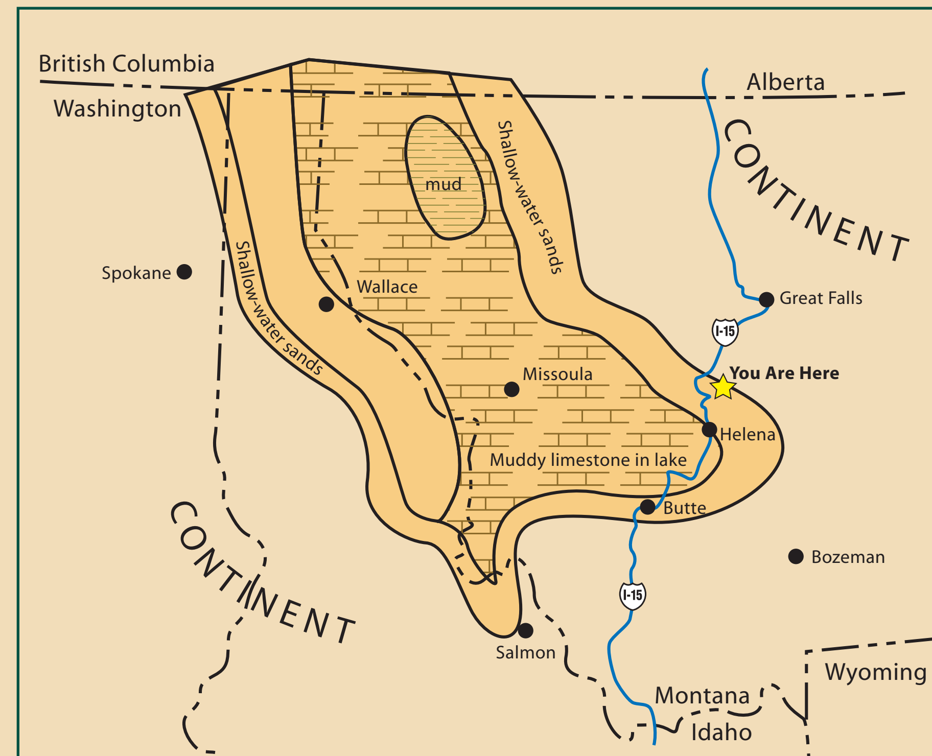
Middle Belt sandstones and limestones may have formed in a shallow lake full of green algae. —Redrawn from Winston, 1989.

Like most sedimentary rocks, there were originally laid down as horizontal layers. About 70 million years ago these rocks were crumpled, folded, and faulted during formation of the Rocky Mountains. As the floor of the Pacific Ocean slowly collided with the western margin of North America the horizontal layers became bent, broken, and tilted as you see them now. The most pronounced crumpling is here in the “overthrust belt” near the eastern edge of the Rockies. The Precambrian sedimentary rocks thin eastward in this area where they overlie the hard granite-like “basement” rocks of the central part of the continent.