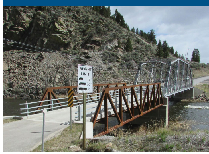
How to understand and interpret Montana's bridge weight restrictions and signs.