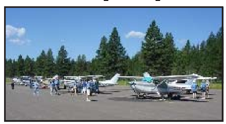
Last month, a flying tour group stopped at our Lincoln airport on its way across the country. After the group enjoyed lunch and some static displays presented by the Recreational Aviation Foundation and local pilots at the airport, it headed off in a covered wagon to visit some local sites and to spend the night in Lincoln.