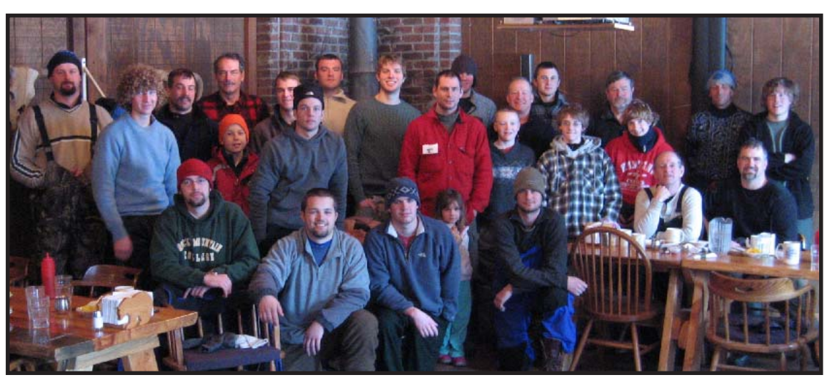
The hearty survivors from the 2008 MDT Surratt Memorial Winter Survival Clinic enjoy breakfast and a classroom debrief at Ponde' Roses Cafe in Lincoln.