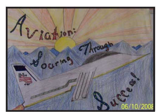
3rd Place, Ciera Wingo, Philipsburg

MDT attempts to provide accommodations for any known disability that may interfere with a person participating in any service, program or activity of the Department. Alternative accessible formats of this information will be provided upon request. For further information call (406) 444-6331 or TTY (406) 444-7696. MDT produces 2,400 copies of this public document at an estimated cost of 39 cents each, for a total cost of $936. This includes $565 for postage.