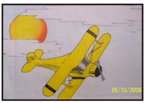
2nd Place, Cassy Graveley, Avon