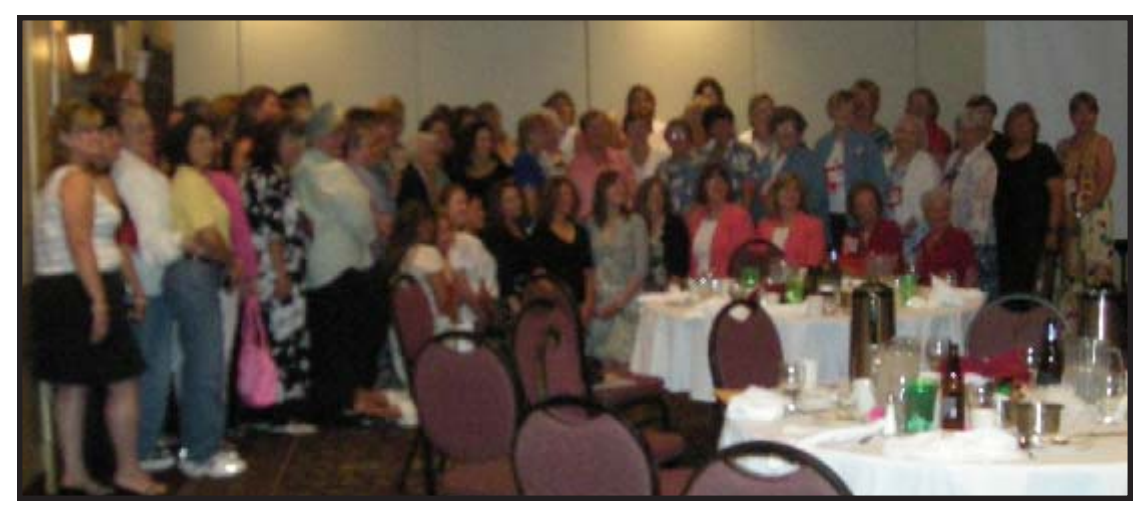
The 32<sup>nd</sup> Annual Air Race Classic had 33 aircraft participating with racers ranging from 90 years to 20 years old. Pictured are racers at one of the dinners held in their honor.