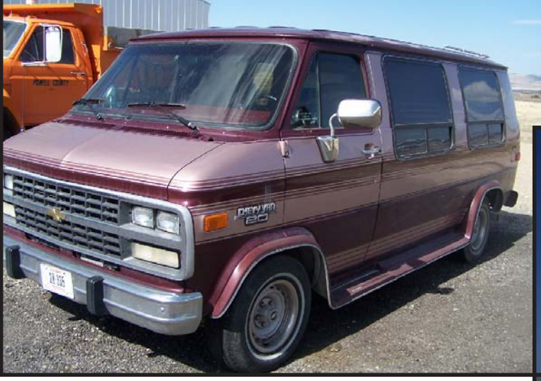
The Deer Lodge Airport continues to grow and improve customer satisfaction. Here are two examples. The Airport recently installed a new automated credit card fueling system and acquired a new courtesy van with the assistance of a Montana Aeronautics Division grant. Congratulations Deer Lodge, and keep up the good work!