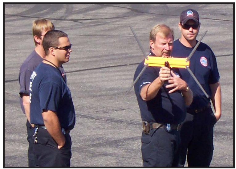
The Billings Airport Operations now has direction finding equipment and they have agreed to help locate ELT's on the Billings airport.

Aeronautics Division Montana Department of Transportation