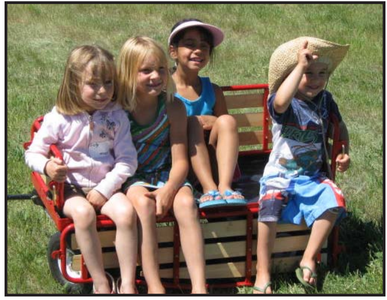
This group of hard workers took a much deserved break before lunch was served.

Once again, we did what we have always done in the past by filling runway badger and gopher holes, using poison smoke to kill the pesky rodents, replacing damaged runway cones, clearing weeds and other general upkeep. After working long and hard in the evenly tempered mid-July sun, we came back to the comfort of lawn chairs, shade under aircraft wings and of course, the best hamburger cookout around. As we dined, we listed to short presentations by various representative parties including US and Canadian Customs, Alberta Flying Farmers, Nav Canada, Montana Pilots Association, as well as