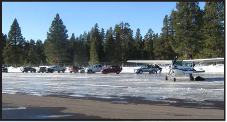
The Lincoln Airport base camp of the overnight MDT Aeronautics Surratt Winter Survival Clinic, where some participants drove and some flew to survive!