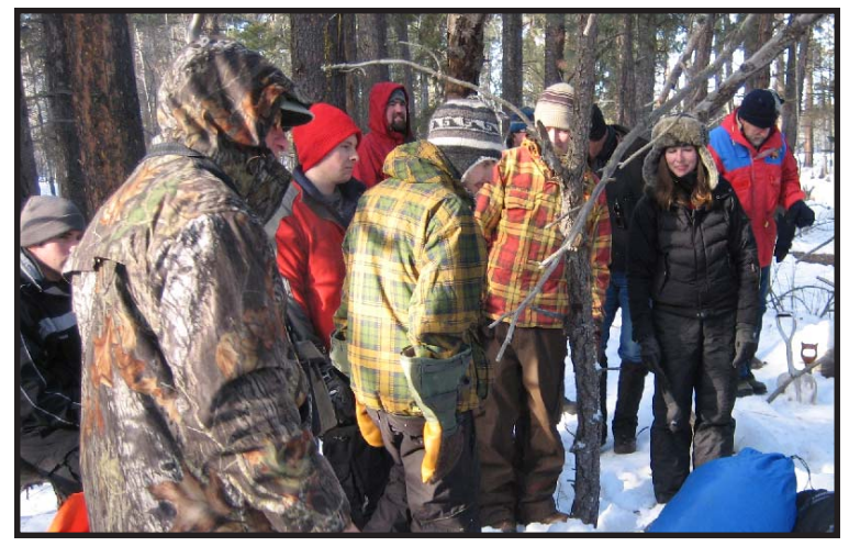
Eight students from the aviation department at Rocky Mountain College of Billings attended this year's winter survival.