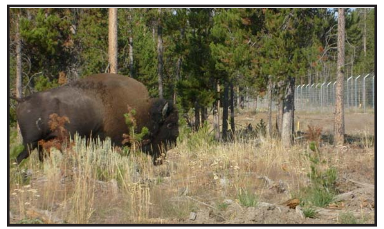
Local wildlife stay off the runway thanks to the recent fencing project completed at the Yellowstone Airport.

Yellowstone Airport and Yellowstone Aviation invite you to tour our facilities and partake in a host of events for the weekend of August 7-9. Yellowstone Aviation would like to invite all to enjoy their brand new fixed base operator building located just north of the Fire Station. We hope to have a lot of you here and will be providing a BBQ sponsored by Yellowstone Aviation on August 8 from 10:00 a.m. until we run out of food. If you have never been to an event hosted by us you will find that we pride ourselves in putting on BBQ's that are second to none.