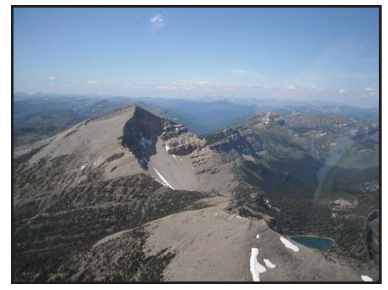
Pentagon Mountain, photo courtesy of Robert Shropshire

Once you are ready to go, remember that your airplane is subject to much more vibration in the backcountry airstrips. Do a particularly thorough pre-flight. Tighten anything loose on your airplane. Secure everything inside your airplane. Know how much fuel you have in your tanks and know your