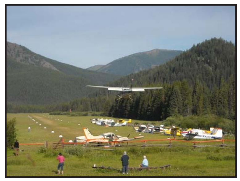
Landing on Schafer Runway.