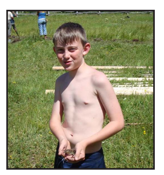
Frog catching is always a popular sport for the younger crowd at Schafer.