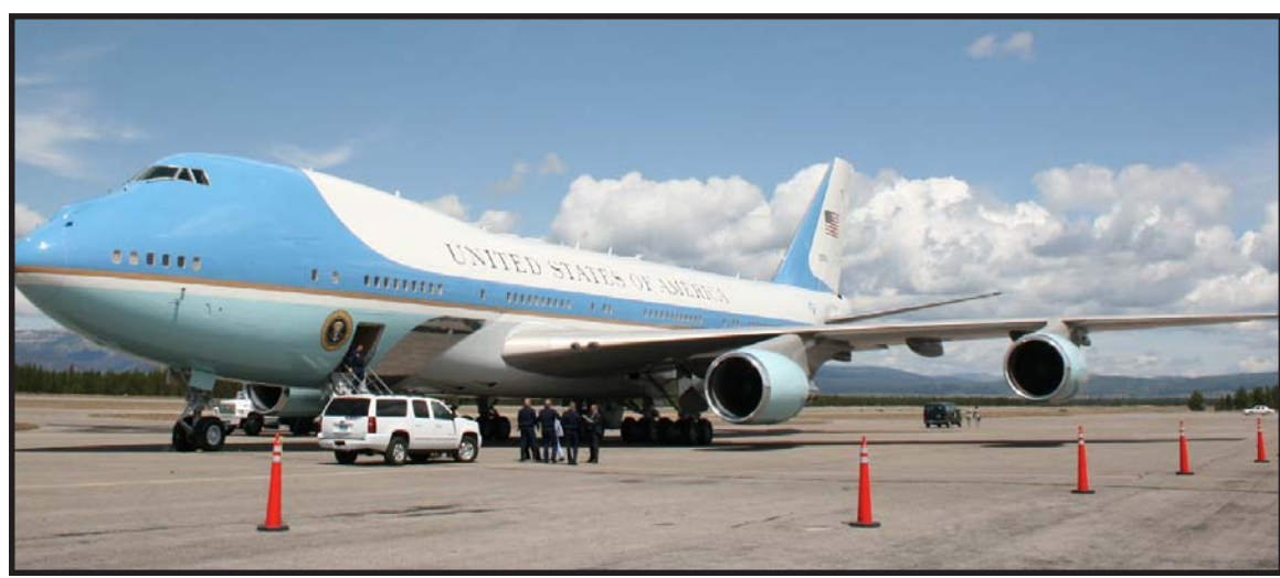
Air Force One.

Time was spent securing items to adequately support the necessary requirements. We needed more fire support, an ambulance, an extra fuel truck, aviation ground equipment, blocking vehicles, a press area, among other details. I would like thank the following entities on behalf of the Yellowstone Airport and Yellowstone Aviation as we could not have accomplished it without your help: Helena Regional Airport and Rocky Mountain Emergency Services Training Center for providing two fire vehicles with crews; the Hebgen Basin Fire District for providing fire and ambulance support with crews; the US Interagency Fire Center (SmokeJumpers) at Yellowstone Airport for the assistance in ramp space and offloading equipment; Aeromark Aviation of Idaho Falls for assistance in loaning a fuel truck and driver; Montana Department of Transportation Highways Division for transporting Helena Regional's fire truck; and especially the Duck Creek Section House for helping us set up and providing blocking vehicles; the Town of West Yellowstone for providing additional blocking vehicles; Montana Department of Livestock for literally providing a "Press Pen"; all state,