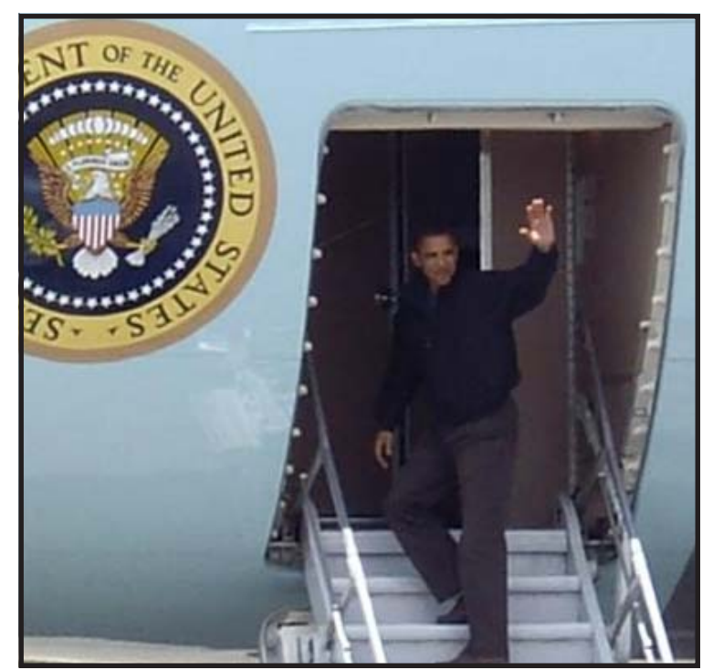
President Obama waves to the crowd at Yellowstone Airport departing from his trip to Yellowstone National Park.

Marine One finished the missions in Yellowstone National Park and brought the First Family back to Yellowstone Airport to board Air Force One for a flight to the Grand Canyon National Park. Upon arrival, the Secret Service allowed the press to view the departure as well as some people to meet and greet President Obama. Security ratchets up quickly for any