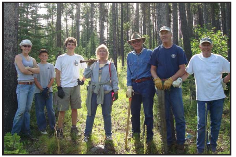
A few of the hardworking volunteers at Schafer!