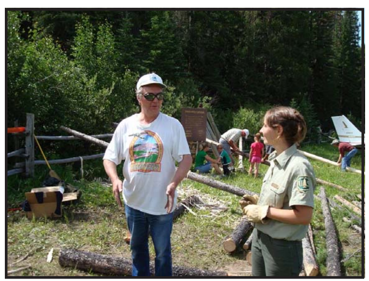
Maintaining Schafer Meadows is a group effort of volunteeers and Forest Service employees.