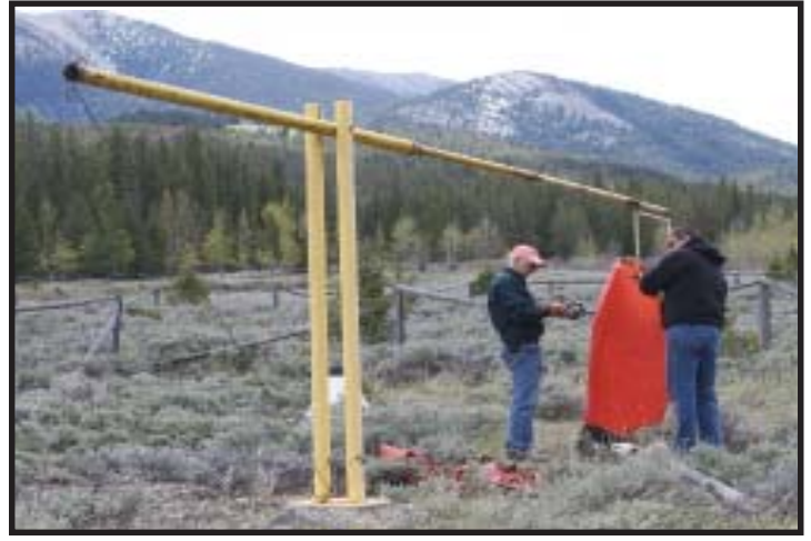
Several pilots flew in to this beautiful back country airstrip to assist with the work session that help make these strips safe for all to enjoy. Above, volunteers install a new windsock.