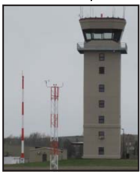
The ADS-B tower is in and operating at Glacier Park International Airport. It will be in testing for several months before going into service.