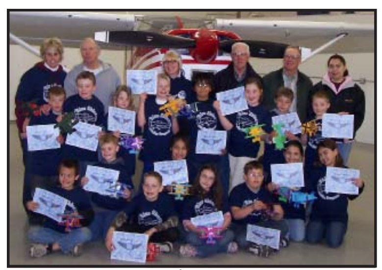
Blue Skies Aviation Program 3rd grade class.