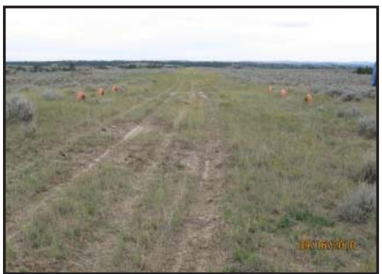
Runway 27, Knox Ridge Airport one of the six new Missouri River Breaks Airstrips.