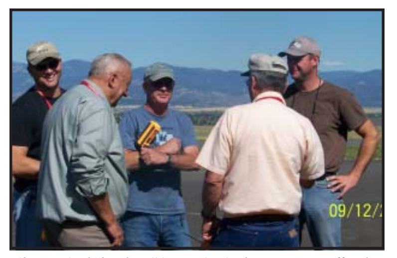
Pilots received "hands on" instruction in the ELT course offered at the clinic.

It was a wonderful weekend and enjoyed by all.