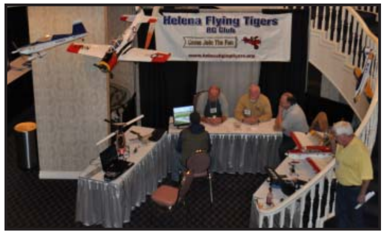
The Helena Flying Tigers RC Club's booth was a great addition to the exhibit area with a flight simulator for all to enjoy.