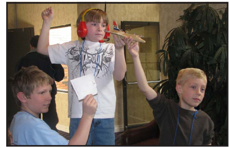
Participants in the aviation education workshop were able to test their newfound knowledge on a group of students. Fun was had by all!