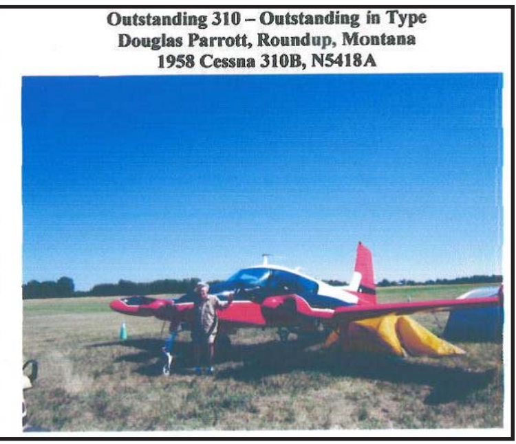
Doug in front of airplane at Oshkosh. Doug and sons Don and Jeff and grandson Teagan all flew to Oshkosh in the 310 and set up camp beside it - a great adventure!