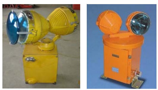
The Browning airport had their rotating beacon (left) replaced with a newer rotating beacon (right).

We removed the old existing rotating beacon on the Browning airport. This beacon, which has been in service for at least 30 years, is still in working order and will be used by the Richey airport. The new beacon is made by a company called Hali-Brite, and uses two 150 watt metal-halide lamps, belt driven, and has mercury switches to transfer the power to the lamps. The old ALNACO beacon had two