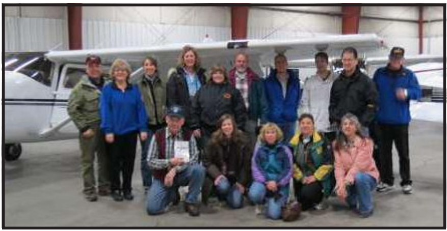
"Take off with Aviation Education" Participants and Instructors

On Friday afternoon, the teachers were paired with licensed pilots and learned how to prepare a cross-country flight from Missoula to Glacier. Next was a visit from Big Sky Density Flyers, the first Montana