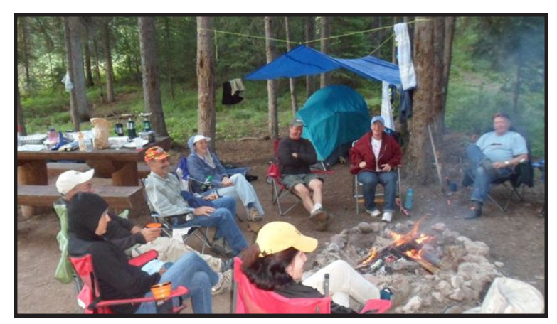
Relaxing by the campfire after a long day.