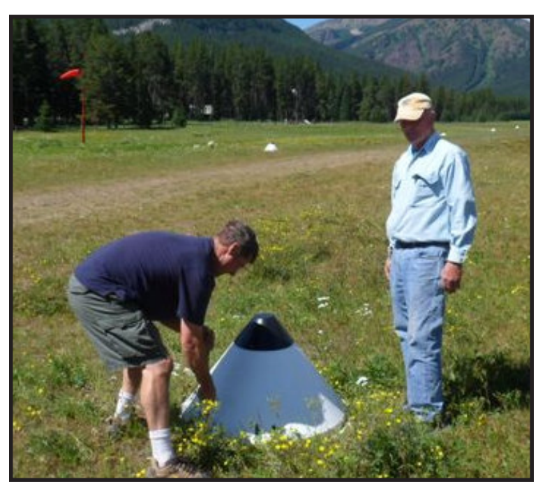
Moving Runway Cones.