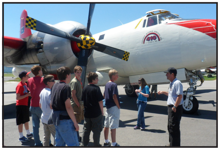
The students had a great afternoon with an up close and personal tour of Neptune Aviation.