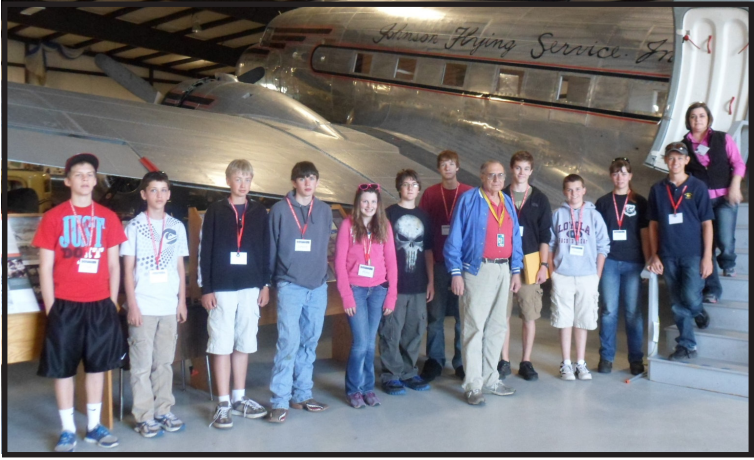
The students visit to Museum of Mountain Flying in Missoula was definitely one of the high points of the two day camp.