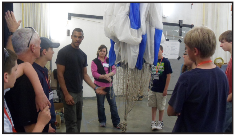
The students were excited to hear about aviation careers such as working for the Forest Service as a smoke jumper.

The Aviation Career Academy (ACE) program this year was held June 21 & 22. The agenda gave high school grade students the opportunity to explore different aviation career programs. Twelve students were picked from individual essays and teacher recommendations from around the state.