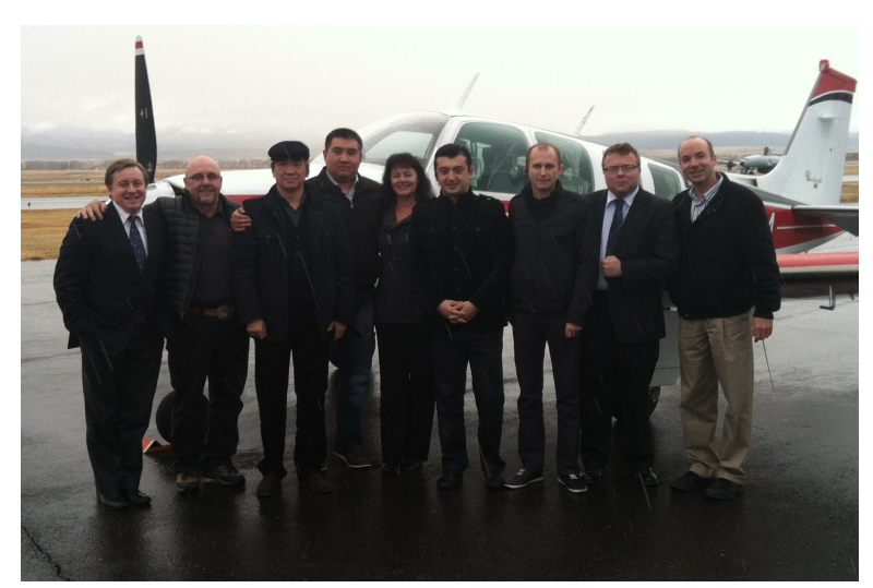
A delegation from Kyrgyzstan visited the MDT Aeronautics Division through the International Visitor Leadership Program. For further information see the Administrator's Column on page 2 of the newsletter.