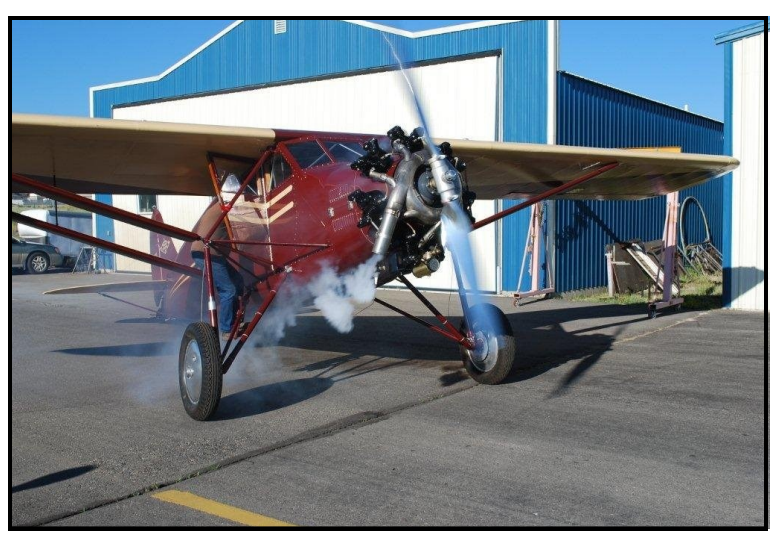
The Detroiter barks to life on its maiden flight.