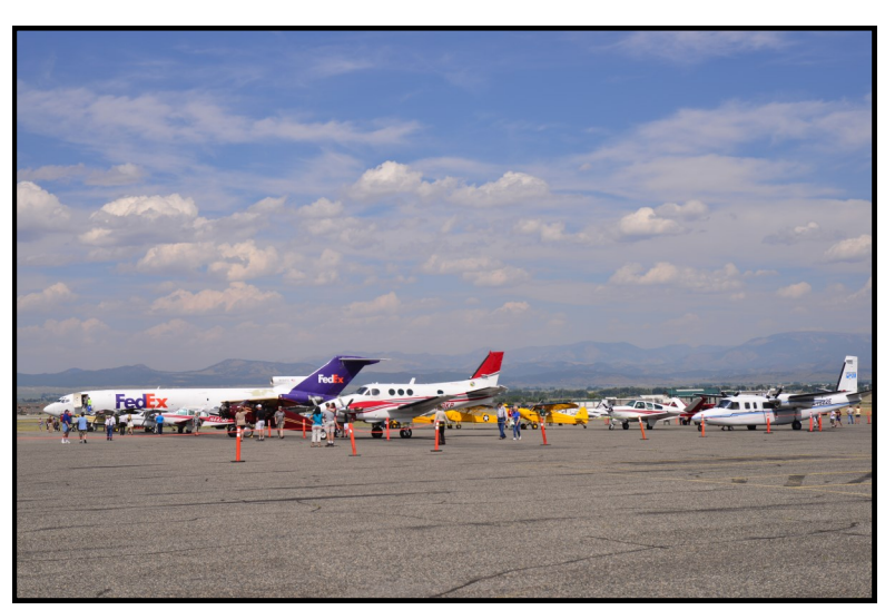
A great variety of aircraft were on display for all to enjoy.

school aged students discover the fun, freedom and accessibility of personal aviation through a hands on flight.