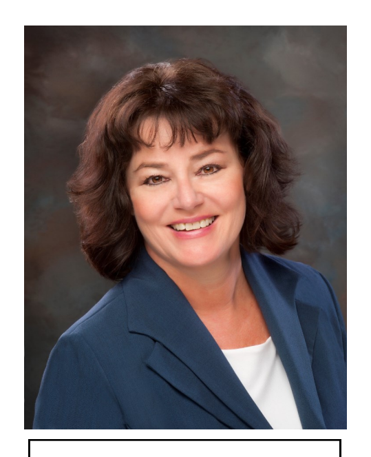
Montana and the Sky Department of Transportation

UAS Approval: Federal regulators say they have certified two types of unmanned aircraft for civilian use, a milestone expected to lead to the first approved commercial drone operations later this year. The FAA said the drones are Insitu's Scan Eagle X200 and AeroVironment's PUMA. Both weigh less than 55 pounds, are about 4.5 feet long and have wingspans of 9 to 10 feet. A major energy company plans to fly the Scan Eagle off the Alaska coast to survey ice flows and migrating whales. The PUMA is expected to support emergency response crews for oil spill monitoring and wildlife surveillance over the Beaufort Sea. Nonmilitary use of drones in the U.S. has been mostly limited to police and other government agencies.