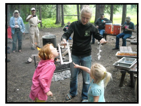
Homemade ice cream and the beautiful Great Bear Wilderness – it doesn't get any better than this!