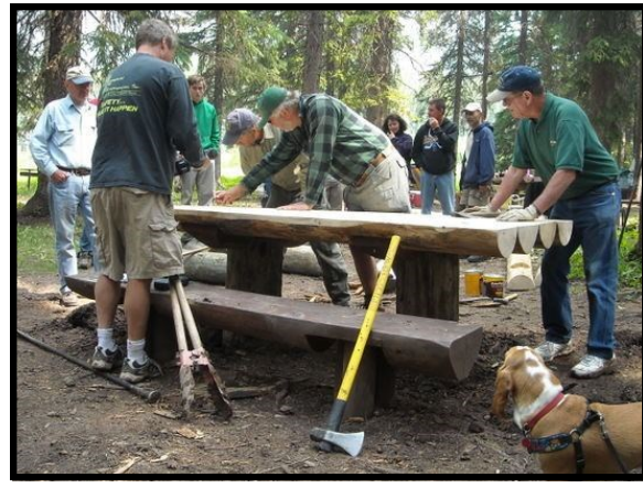
Volunteers replaced one of the picnic tables at Schafer Meadows camp ground.