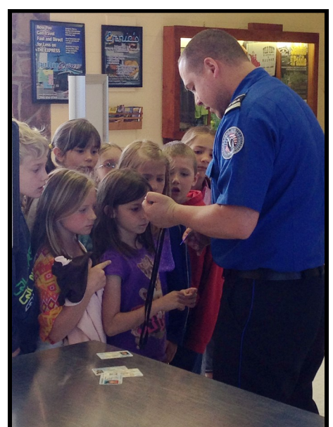
A TSA agent at Yellowstone Airport made luggage tags for the students.