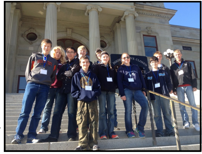
ACE students in front of Capital building.