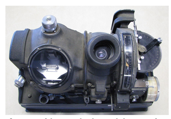
Once one of the most closely guarded secrets of WWII, this is one of two Norden Bomb Sights at the museum. It was used during the war for training purposes for bombardiers and is operational.

For updates on all airport functions go to our website at <a href="www.cutbankairport.org">www.cutbankairport.org</a> or find us on Facebook at Cut Bank International Airport.