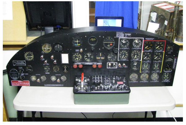
This replica of a B-17 cockpit panel is on display at the Airmen's Museum. It incorporates instruments from actual combat B-17 aircraft.

The museum is open during regular hours Monday through Friday, and airport tours are available any time by special arrangement. The airport, which was a WWII B-17 training base has been listed on the National Registry of Historic Places since 2007.