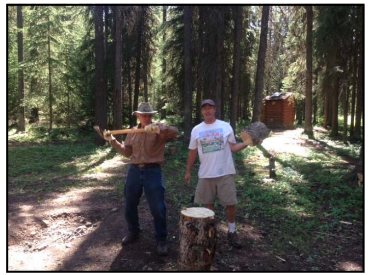
At Schafer, it's always a team effort.