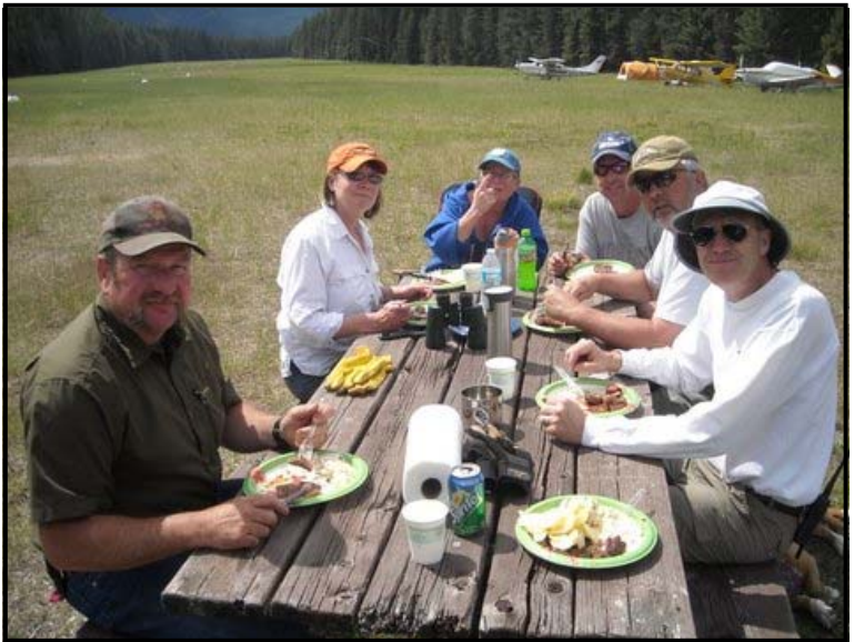
After working all day a delicious lunch was served to the volunteers.