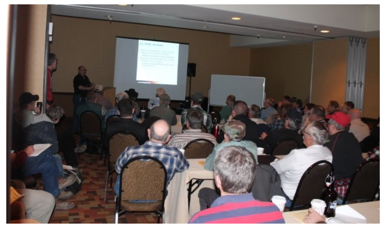
The meeting room for IA renewal is always full and then some!

For an A&P Mechanic, with an IA, to be eligible for renewal of their IA they must show that they are actively engaged in aircraft maintenance and also show completion of one of the five activities described in §65.93 (a) (1) through (5) below by March 31 of the first year of the 2-year inspection