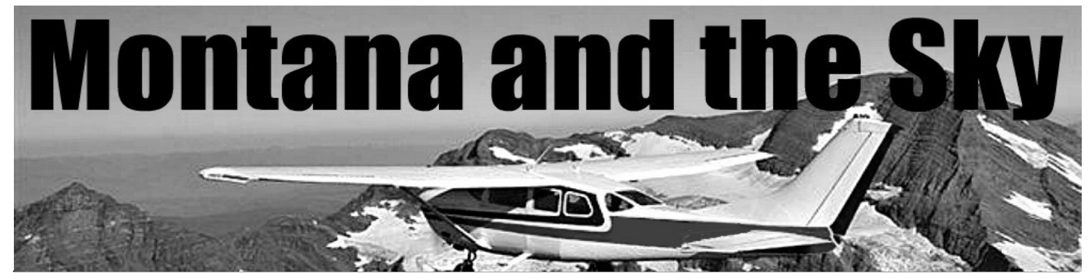
Montana Department of Transportation