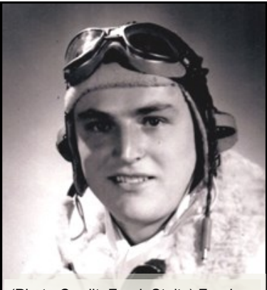
Frank Stoltz in the U.S. Army Air Corps in the early 1940's.

the long march home. The Russian army forced-marched the entire contingent of prisoners across Poland and Germany in a