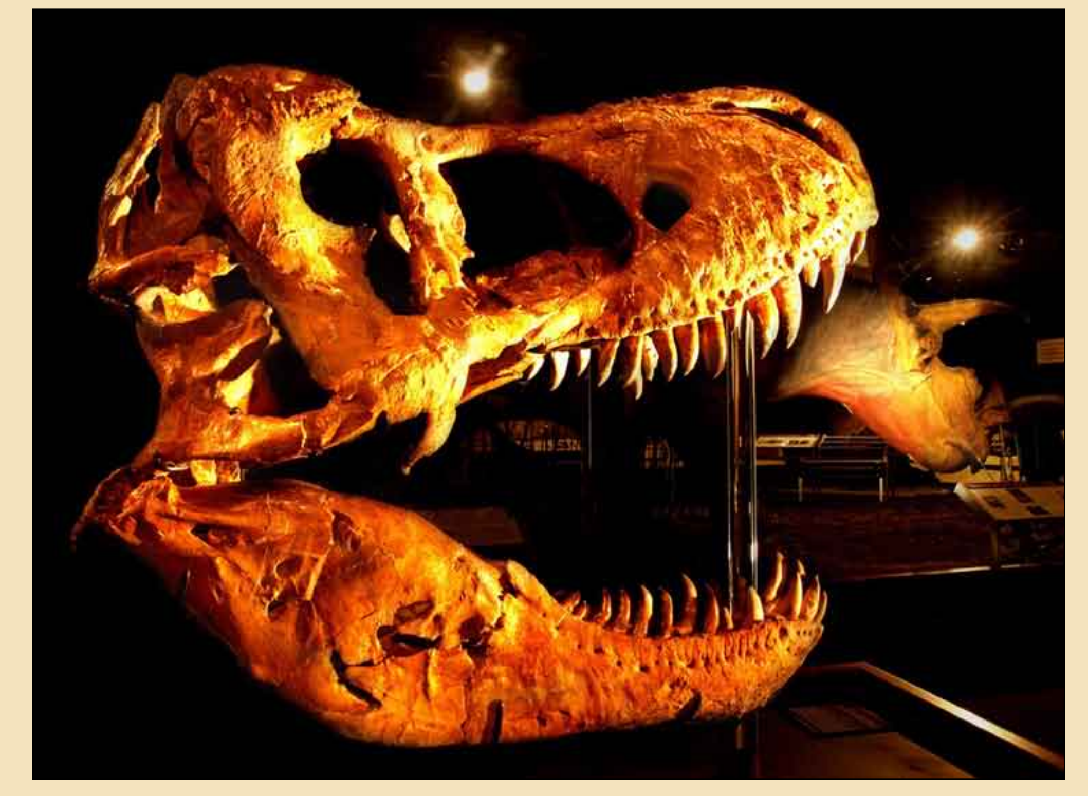
Measuring 5-feet across, the T-rex skull pictured is the largest in the world. The specimen is now on display at the Museum of the Rockies at Montana State University.

Montana's big sky drew tourists even during the darkest days of the Great Depression in the 1930s. Thousands of people came to Montana to enjoy its wide open spaces and experience its Old West heritage. Good roads and cheap gasoline helped make it possible. The Montana Department of Transportation distributed colorful highway maps and brochures at ports-ofentry stations and information centers. Beginning in 1935, the MDT installed interpretive markers at roadside picnic areas to tell readers about Montana's exciting history. The signs told stories reminiscent of a cowboy spinning a yarn to a greenhorn. Over 250 roadside signs still introduce visitors and residents to Montana's history and geology.