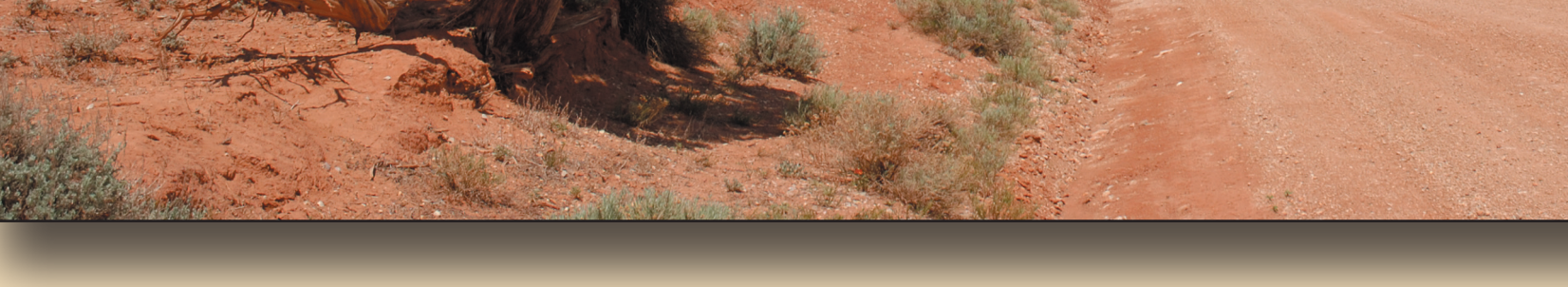
Pryor Mountains, photograph by Kristi Hager.