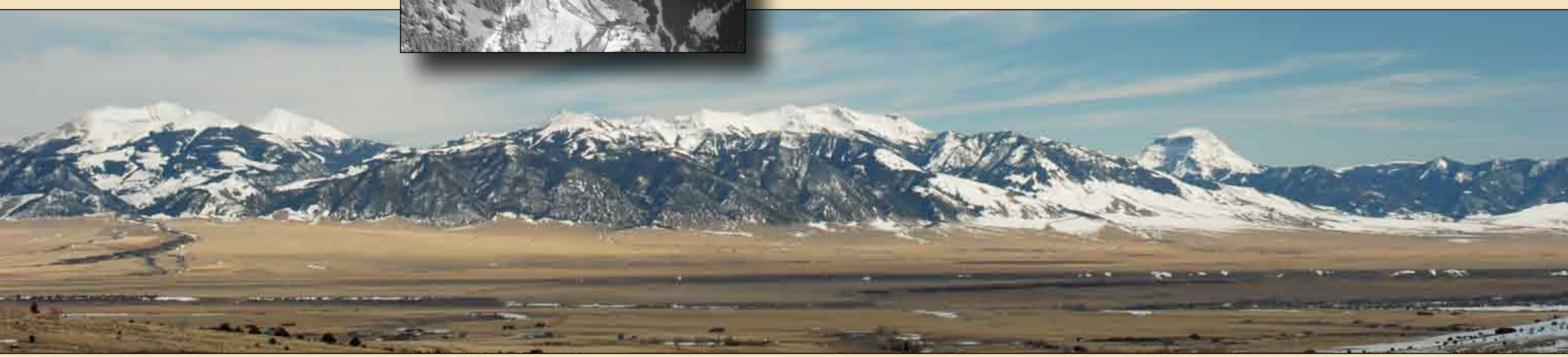
Madison Range.

As you drive through the Madison Valley, keep your eye on Sphinx Mountain. Can you tell why the mountain got its name? Try picking out some other mountains and naming them after things they look like.