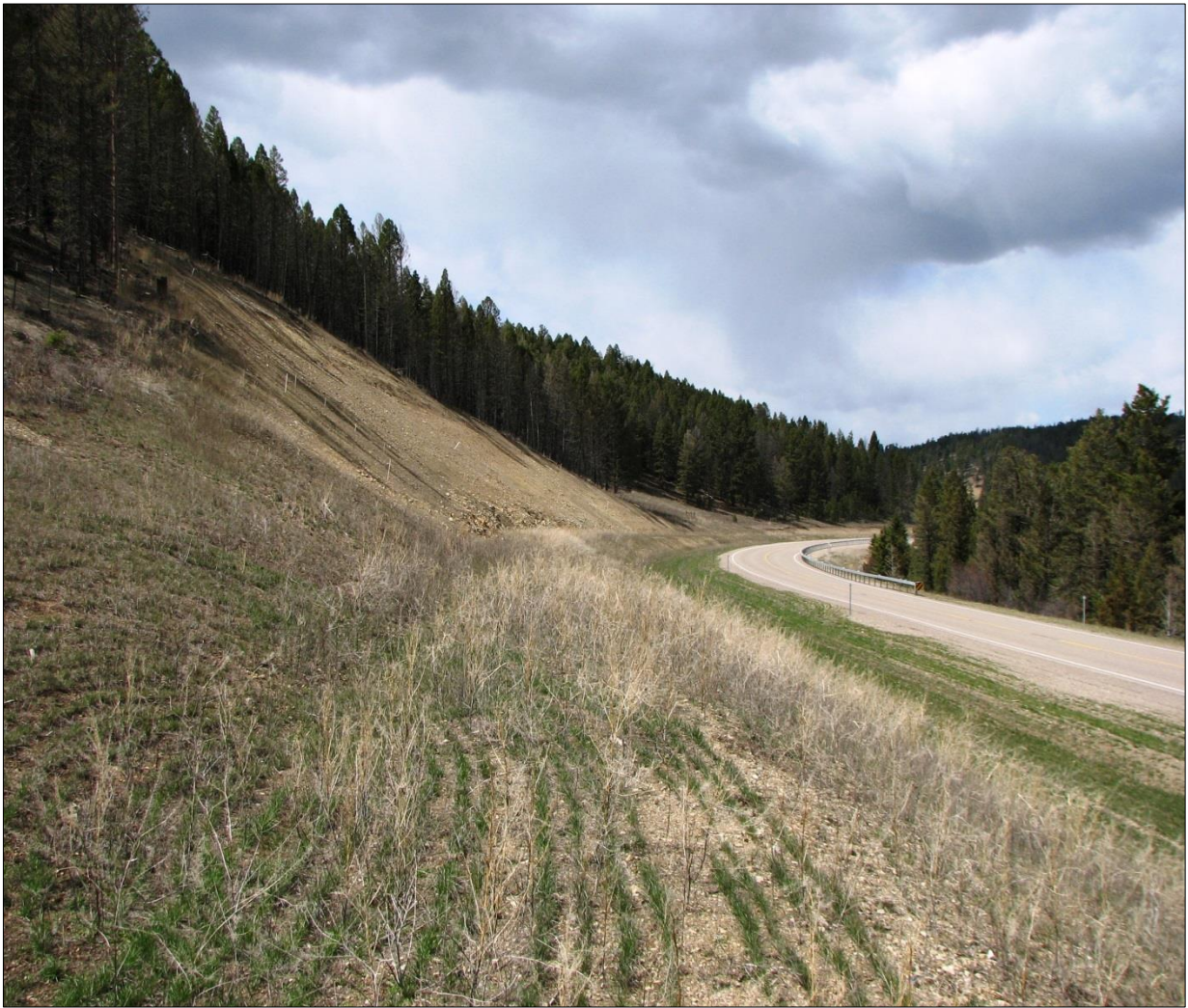
↑ View west: Start of approximate location at the east end of the 18" A-2000.