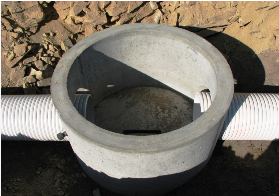
↓ Interior view of manhole connections.