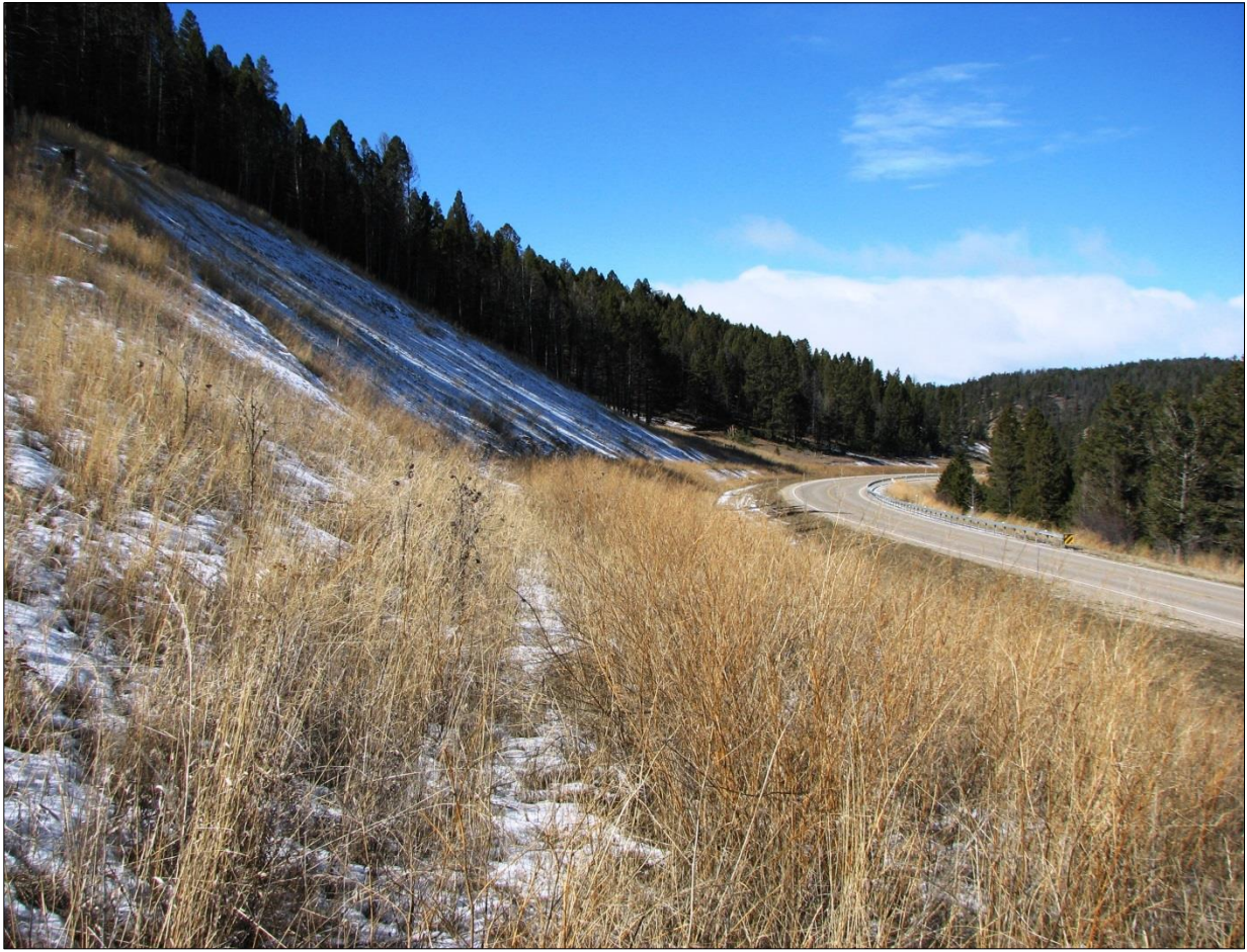
↑ View west: Start of approximate location at the east end of the 18" A-2000.