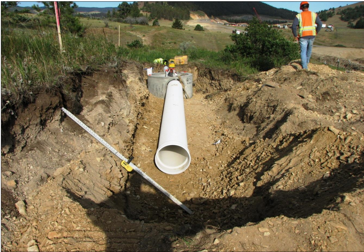
↑ The first section of the A-2000 is placed (view west).