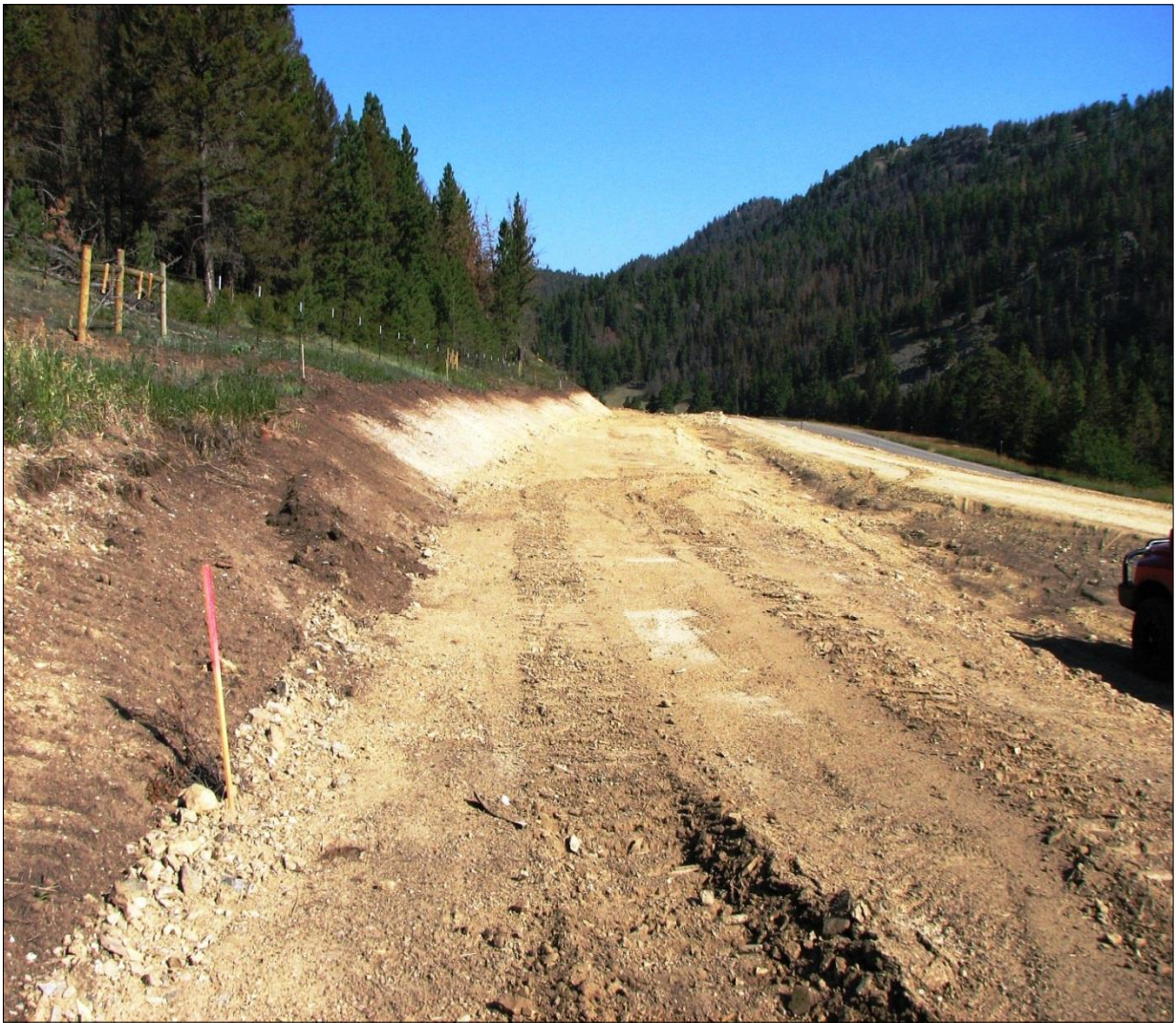
↑ Representative image of the completed A-2000 18" installation (view west).