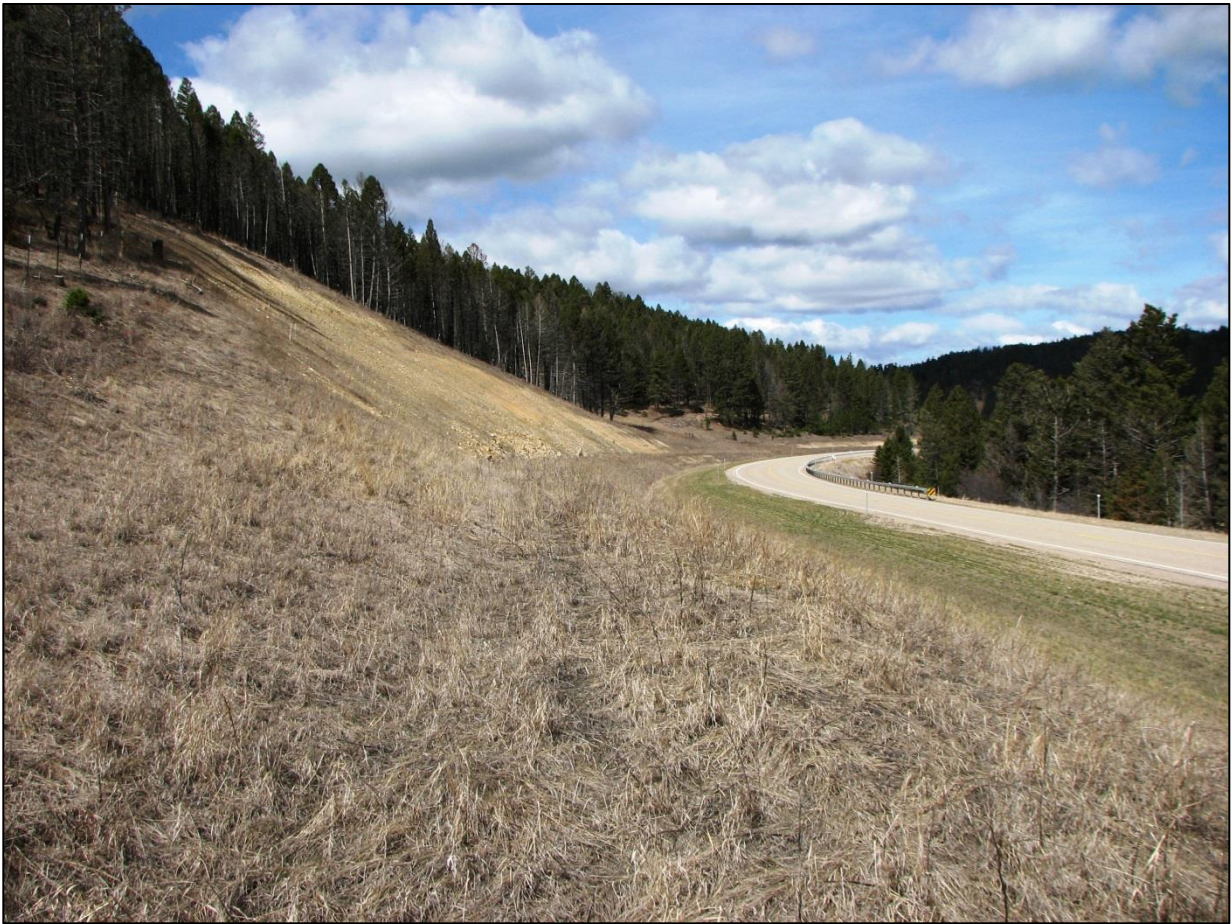
↑ View west: Start of approximate location at the east end of the 18" A-2000.