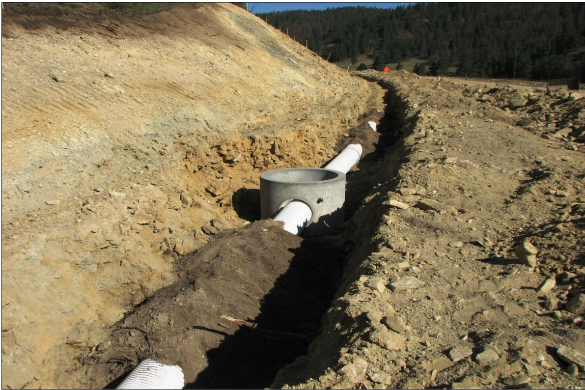
↑ Example image of pipe to manhole installation.