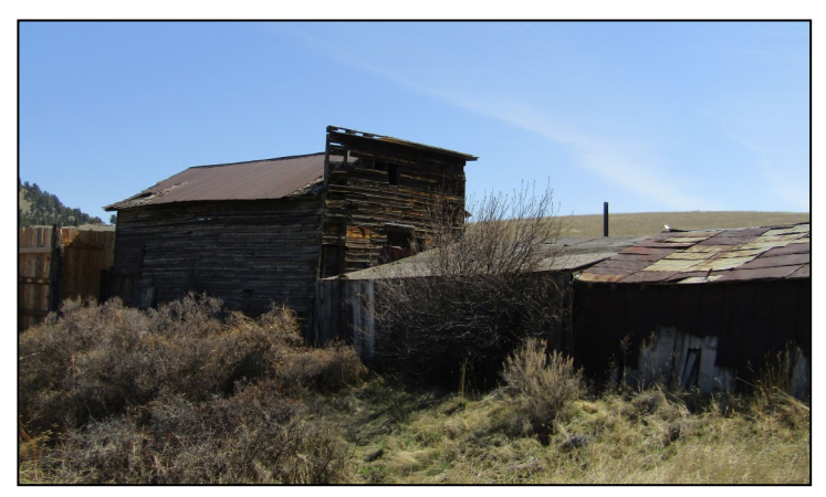
Seven Mile House on the Benton Road a few miles outside of Helena.

It is not known when Seven Mile House finally closed its doors. It last appears in Helena newspapers in 1892. By then, the Benton Road had been eclipsed by the Northern Pacific and Montana Central railroads, both of which passed very close to the property. For a few years, Seven Mile House was a landmark for travelers on the Benton Road, but perhaps one that was better not to visit.