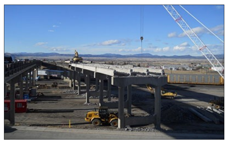
Construction on I-15 near Helena.

For more information, contact Sue Sillick at 444-7693 or ssillick@mt.gov , or the project website at mdt.mt.gov/research/projects/const/production rates.shtml