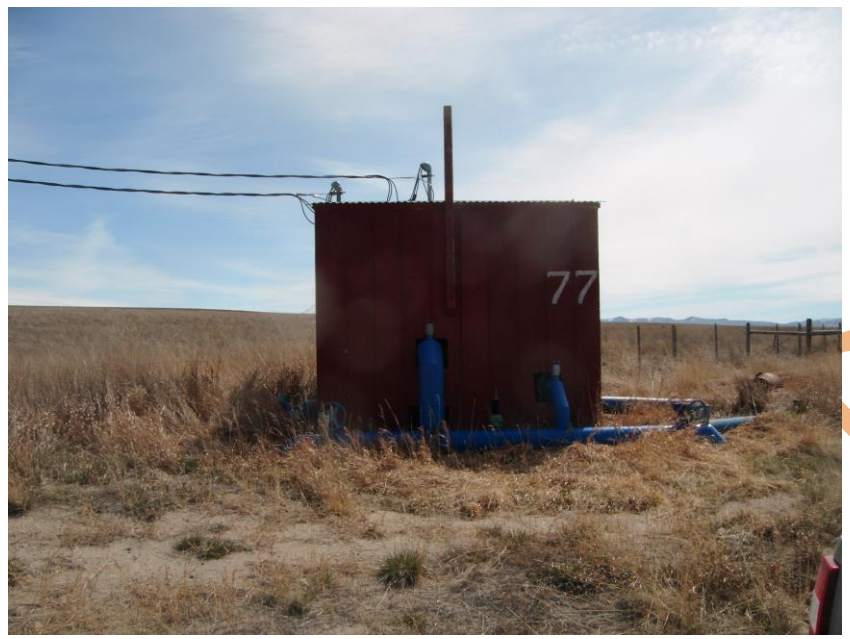
MP 10.8, east side road – irrigation pump station