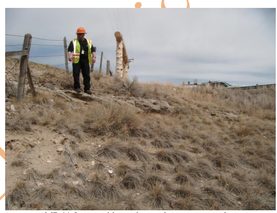
MP 11.8, west side road – sandstone outcropping