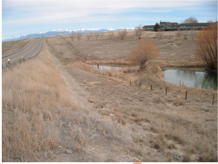
MP 12.7, looking North – Wetland/Private Ponds