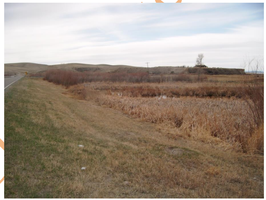
North End of Beaverhead River Bridge, looking south – Wetland area