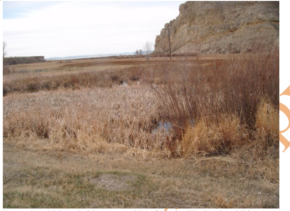
North of Beaverhead River Bridge, west side of road – Wetland and Limestone outcrop