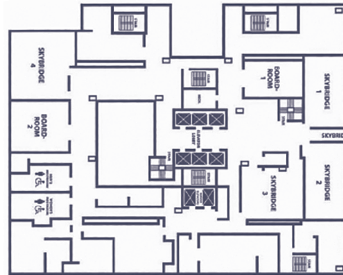
2 nd Floor Meeting Facilities