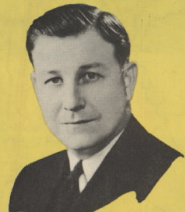
Governor John W. Bonner

"Hospitality" is no hollow word in Montana. Treasure State residents take pride in making strangers feel at home. We are one of the few states that operate entry stations at our borders to welcome the visitor and give him every aid in making his stay enjoyable.