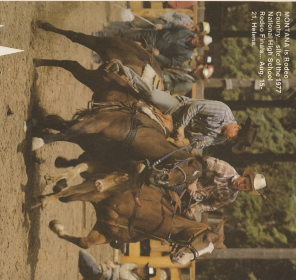
MONTANA is Rodeo Country... Site of the 1977 National High School Rodeo Finals... Aug. 15-21, Helena.