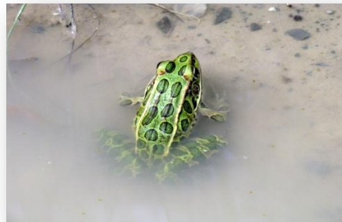
Northern Leopard Frog