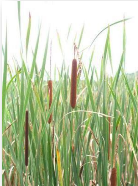
Typha latifolia (Broadleaf cattail)

Type 3- Pondweed/Water milfoil ( Potamogeton/Myriophyllum )