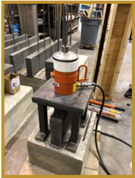
Figure 3: Bar pullout test setup.

the bond behavior was investigated by conducting direct tension pullout tests (Figure 3). In these tests, the effect of embedment length, concrete cover, bar spacing, and bar size were investigated.