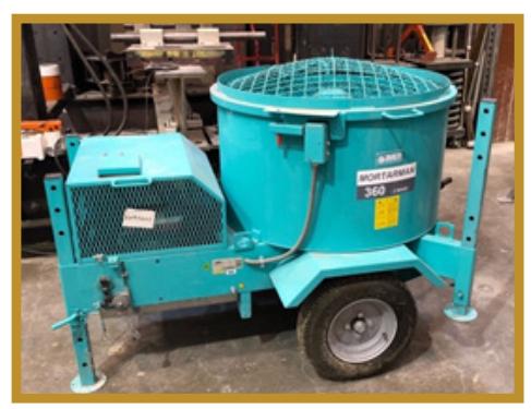
Figure 1: Imer Mortarman mixer used for larger-scale mixes.

The bond behavior of deformed reinforcing steel in the newly developed non-proprietary UHPC was characterized, and its effect on bar development lengths was investigated to confirm its performance in the proposed application. Specifically,